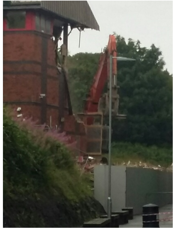
Ongoing demolition works – July 2018