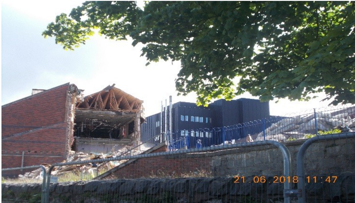
Commencement of demolition works June 2018