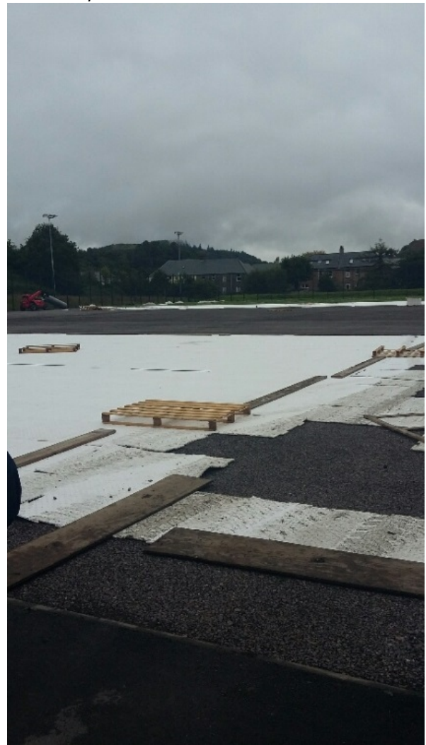
Demolition works and Preparatory works to 3G pitch resurfacing